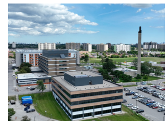
Humber River Health, Finch Campus, 17-acre site