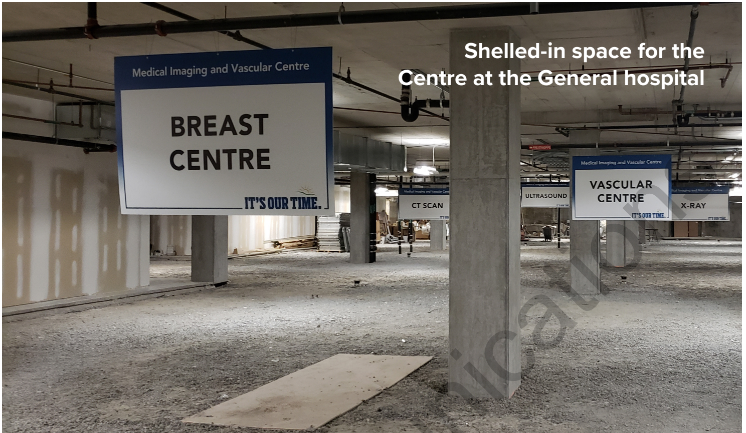
Shelled-in space for the Centre at the General hospital